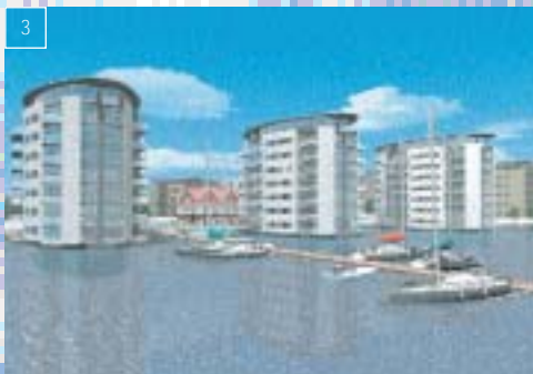
3. Royal Quay is soon to become a stunning new development