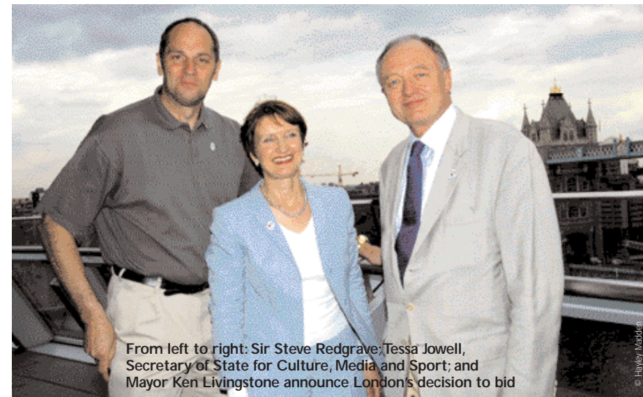
From left to right: Sir Steve Redgrave, Tessa Jowell, Secretary of State for Culture, Media and Sport; and Mayor Ken Livingstone announce London's decision to bid