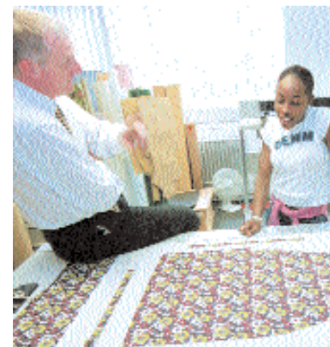
Left and right: Models at the launch of the Centre for Fashion Enterprise Below: Student and her tutor at the London College of Fashion

The Commission brings together leading industry players to look at ways of building on this success. It is looking at key issues affecting the industry such as how to develop talent, customer chains, finance and affordable premises. The Commission will publish its final report in the autumn.