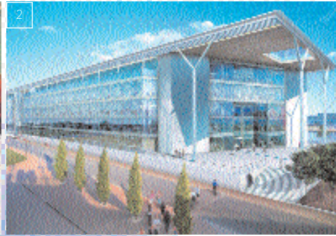
2. Roya's Business Park will be the largest in London