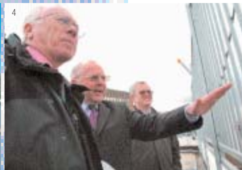
4. Regeneration Minister Lord Rooker inspecting the latest developments